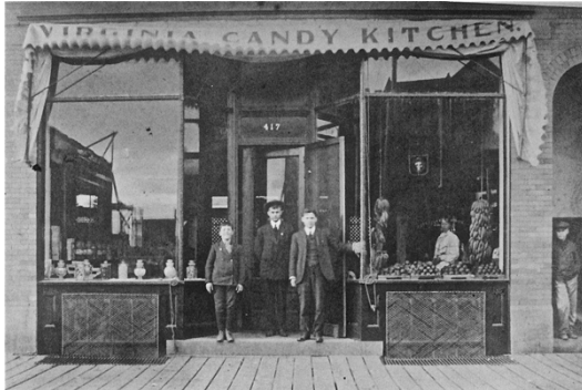
OLD FASHIONED CHOCOLATES & CANDIES SINCE 1905